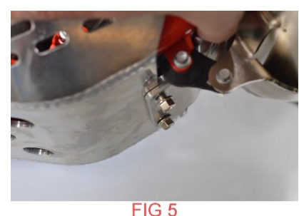
WARNING AND DISCLAIMER